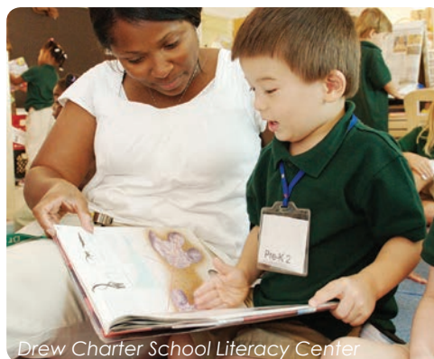
Drew Charter School Literacy Center

Whether it's golfing, gardening, or learning opportunities, your support provides healthy activities for our East Lake community and helps our youth have a great summer while helping to fulfill their potential. ■