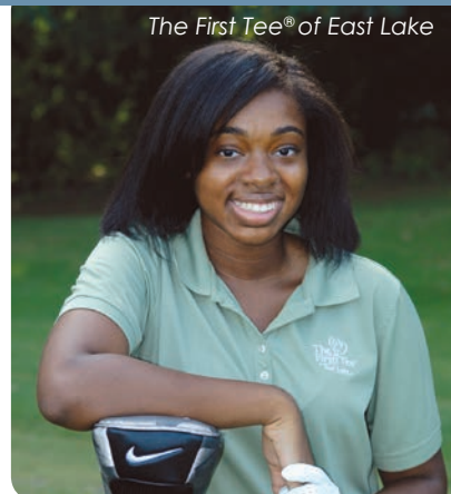
The First Tee® of East Lake

Summer matters. With your support, The First Tee® of East Lake, the East Lake Community Learning Garden, CREW (Creating Responsible, Educated, Working) Teens and the Drew Charter School Literacy Center are able to provide programming that keeps youth engaged and productive during the summer.