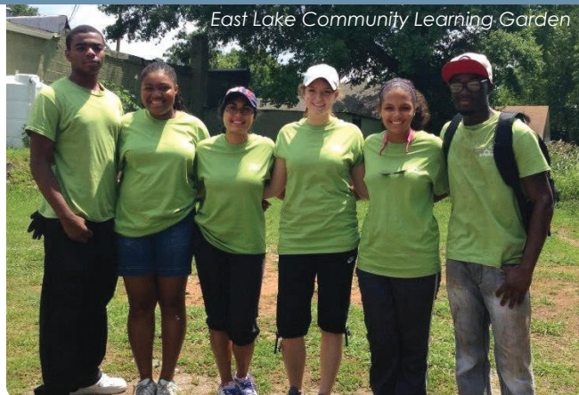
East Lake Community Learning Garden